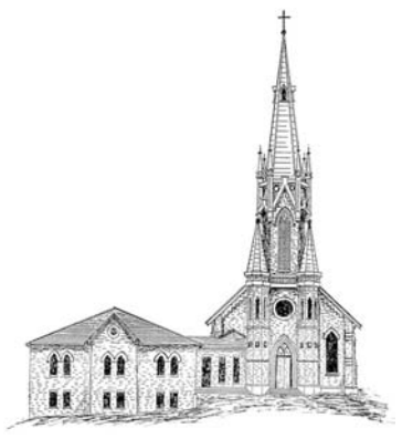
St. Mary of the Assumption Owen Sound

Email: smm@bmts.com www.stmarysandthemissions.ca